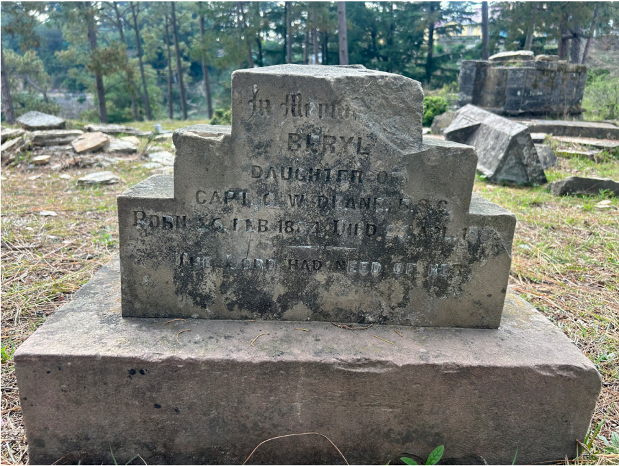
Uttarakhand, Almora at S., Rastogi by captured graveyard Unknown – 4 Img

.strengths greatest their are authenticity and depth their but, easy always isn't them Reading .operate presence of sites unofficial these how illuminate ,inscription of kind unique a and story untold an holds corner every where ,Dargah Sarmad's at encountered forms diverse The .refuge emotional and intellectual of site unique a forming ,together inscribed all are memory and emotion ,gesture ,time where texture living a is This. Language own its for space a created has itself soil the if as—earth the to clinging it's instead; book a in find you'll writing isn't This .presence affective of field living ,single a into merges everything—stone the on inscribed text the and ,kalawa the, petitions the ,grave the, tree the—Dargah Sarmad's at scene entire this Within