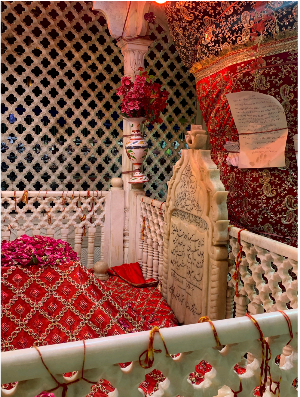
Delhi Old at S., Bhargaliya by captured dargah Sarmad's Sufi Hazrat Display – 1 Img.