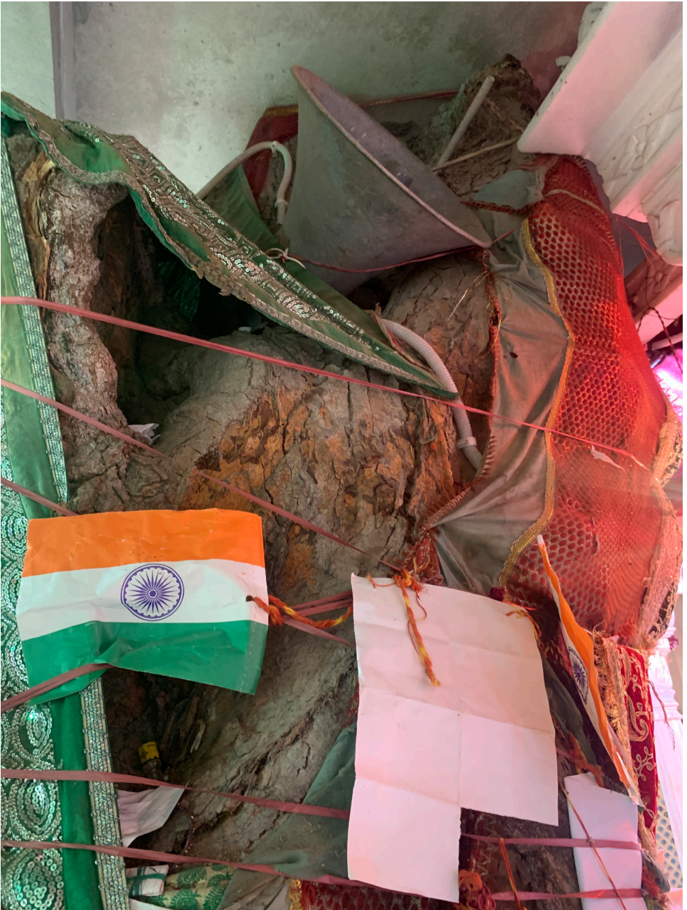
Delhi Old at S., Bhangaliya by captured Dargah Sarmad's at Tree the on Petitions of Display – 3 Img